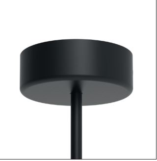
CMB ceiling mounting base